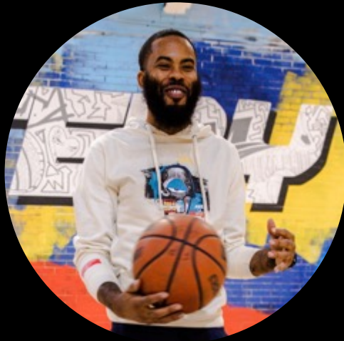
The Art Bully