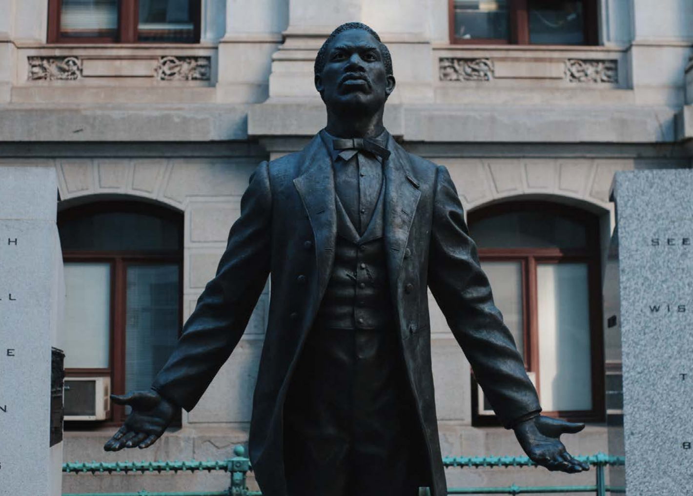
A collection of images by Pho By Mo highlighting her personal connections to the city of Philly as well as her ability to capture history as it unfolds.