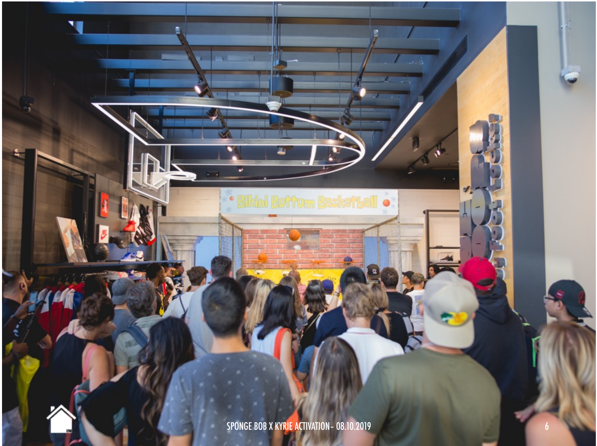
SPONGE BOB X KYRIE ACTIVATION - 08.10.2019