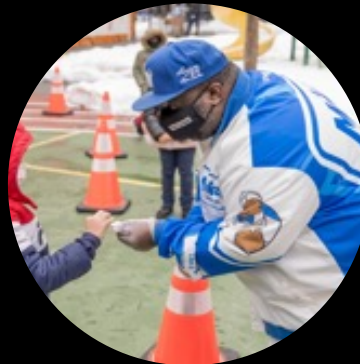
Mikey Likes It